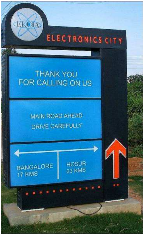
Electronic City – Largest Technology Park in Asia employing more than 1 lakh people