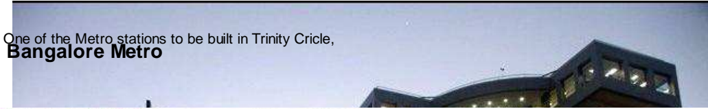
One of the Metro stations to be built in Trinity Circle, Bangalore Metro