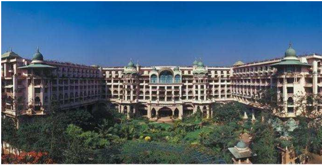
Leela Palace Kempinski