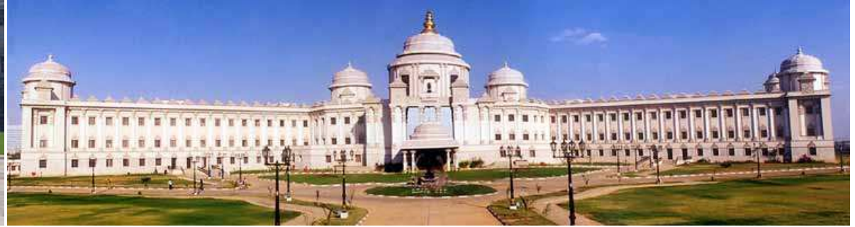
Satya Sai Hospital ,Whitefield