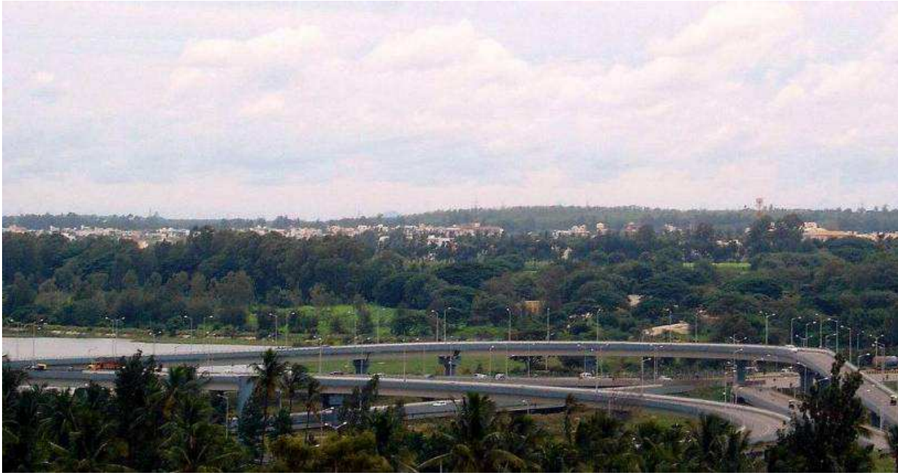
Hebbal Flyover – Engineering Wonder – One of India's largest flyovers – 8.5km