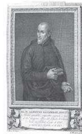
Alfonso Salmeron (Spanish)

2nd Superior General of Society of Jesus