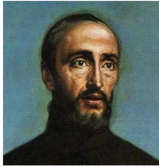
St. Francis Xavier (Spanish)

Principal Founder Author of Jesuit Constitution 1st Superior General