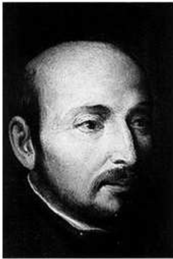
Ignatius Loyola (Spanish)

Principal Founder Author of Jesuit Constitution 1st Superior General