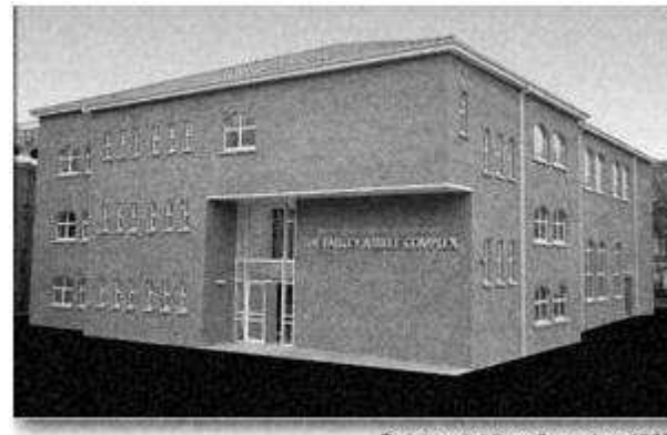
European Institute of Protestant Studies

Address: 356–376, Ravenhill Road, BELFAST, BT6 8GL, Northern Ireland, UK