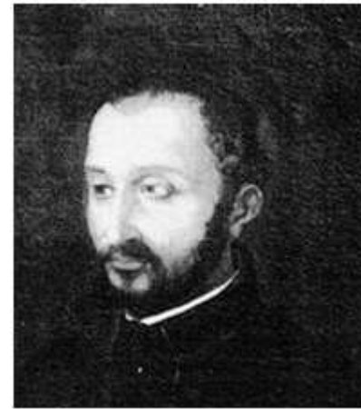
Diego Laynez (Spanish)

2nd Superior General of Society of Jesus