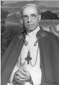
Figure 13 Pope Pius XII and his greed for loot money

“In 1944 alone the Nazi contribution to the Vatican amounted to over $100 million—worth nearly a billion and half in today’s values. The Vatican managed also to