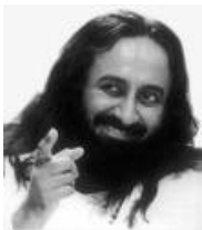
Figure 21 (double) Sri Ravi Shankar

one of our Hindu spiritual gurus offers his salutations to the Pope in the following words: