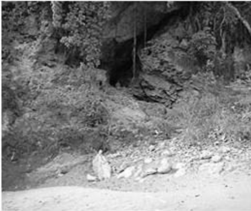
Figure 39-Vashishth Guha

blessing, for their discrimination in religion and their spiritual endeavour, and we will hold our peace.” 193