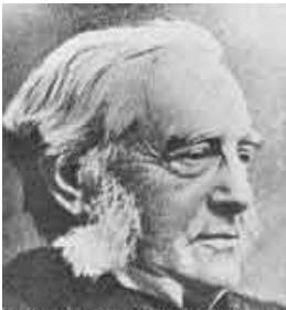
Figure 12 Max Muller in his old age having gathered the courage to take side of the Truth

And with their Christian education system that has been prevailing in our country for six generations , now our Christianized-Hindus have become equally greedy for money. See what a great (or lousy) contribution this Aasuric religion based culture has made of the Hindus.