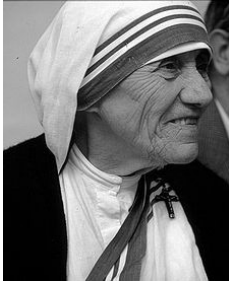
fond of Crime Money