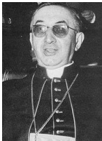
Figure 19 Jean-Marie Villot, Cardinal Secretary of State (May 2, 1969—March 9, 1979) (b. October 11, 1905 d. March 9, 1979)

(criminal activities Racketeering, car theft, conspiracy, Contract killing, construction, building and cement violations, drug trafficking, extortion, fencing, fraud, illegal gambling, Kidnapping, labour and construction racketeering, loan sharking, money laundering, murder, pier thefts, prostitution, hijacking, Securities fraud, solid and toxic waste dumping violations, and wire fraud)