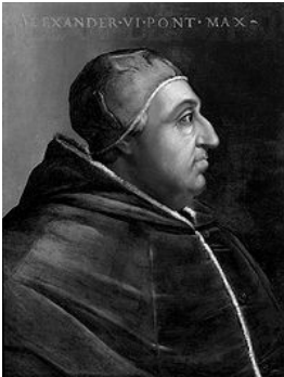
POPE ALEXANDER VI

POPES ARE THE SUPREME SPIRITUAL LEADERS OF CHRISTIANITY – LOOK AT THEIR CHARACTERS THAT RESEMBLE THE INSECTS OF GUTTERS