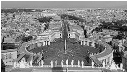
Figure 15 Vatican City