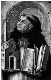
Figure 11 Saint Thomas Aquinas who devised the official Roman Catholic doctrines

Come to think of it, what would then be the characters of the common men and women of Christianity who have such exemplary leaders to show them the way?