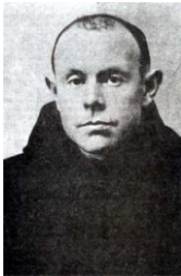
Figure 35-Henry Le Saux French Benedictine Monk 182

HENRI LE SAUX BECAME SW ABHISHIKTANANDA BUT NEVER LEFT CHRISTIANITY TILL DEATH