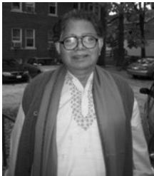
Figure 8 Sunil Gangopadhyay winner of Indian Sahitya Akademi award in 1985

This tells us how low the Christian missionary education has brought us in less than 2 centuries! And, you all are so very proud of that Christian education system.