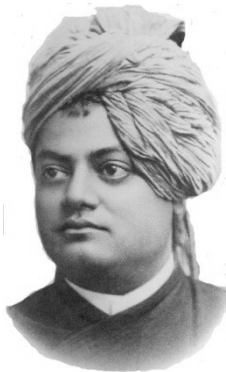
Figure 1 Swami Vivekananda

THEY HAVE BEEN PRACTICING IT ALL ALONG; EVEN SWAMI VIVEKANANDA SPOKE ABOUT CHRIST'S DISCIPLES AND THEIR HATRED FILLED CONDUCTS; HE GAVE EXAMPLES OF WHAT WAS A COMMON PHENOMENON IN THOSE DAYS; CHRISTIAN CHILDREN WERE TAUGHT TO HATE HINDUS – AND, IT IS TRUE EVEN TODAY