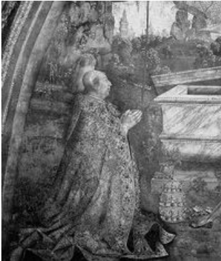
Figure 10 Pope Alexander VI as if deep in prayer

“He played vicious power politics, practiced simony, held famous public orgies in the Apostolic Palace, committed incest with his daughter, went whoring with his son, poisoned his cardinals to get