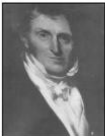
Figure 7 Mountstuart Elphinstone

YOU NOTICE THE VAST DIFFERENCE AS YOU COMPARE ALL THIS FILTH OF CHRISTIAN WORLD WITH THE CHARACTER OF YOUR ANCESTORS UP TO EARLY 19TH CENTURY; YES, BEFORE THESE VERY CHRISTIANS TOOK CONTROL OF THE ENTIRE EDUCATION OF THE HINDUS