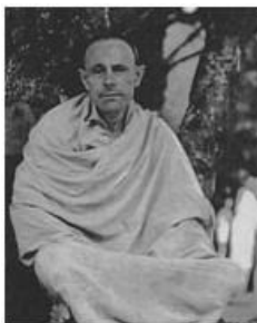
Figure 36-Fr. Henry Le Saux as Sw Abhishiktananda 184 but not leaving Christianity till death 185

“Swami Abhishiktananda (1910-1973) is the Indian name of Dom Henri Le Saux, a Benedictine monk. He co-founded in 1950, with Father Jules Monchanin, Saccidananda Ashram , a monastic institution dedicated to integrating the monastic values of the Benedictine tradition with the values of the Indian monastic tradition ”. 183