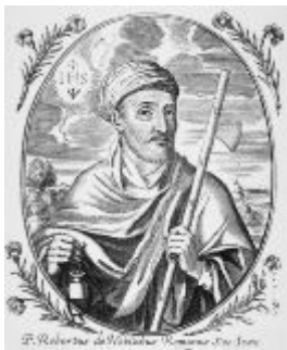
FIRST IMPOSTER ROBERTO DE NOBILI (1577-1657)